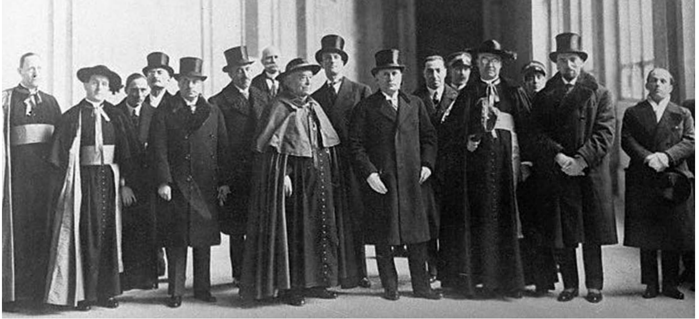
Mussolini's relationship with the Catholic Church and the Vatican was rocky, at best. Here he is shown (center, front, with top hat) with several of his ministers and Catholic officials in the Vatican.